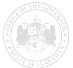
Kay Ivey Governor of Alabama