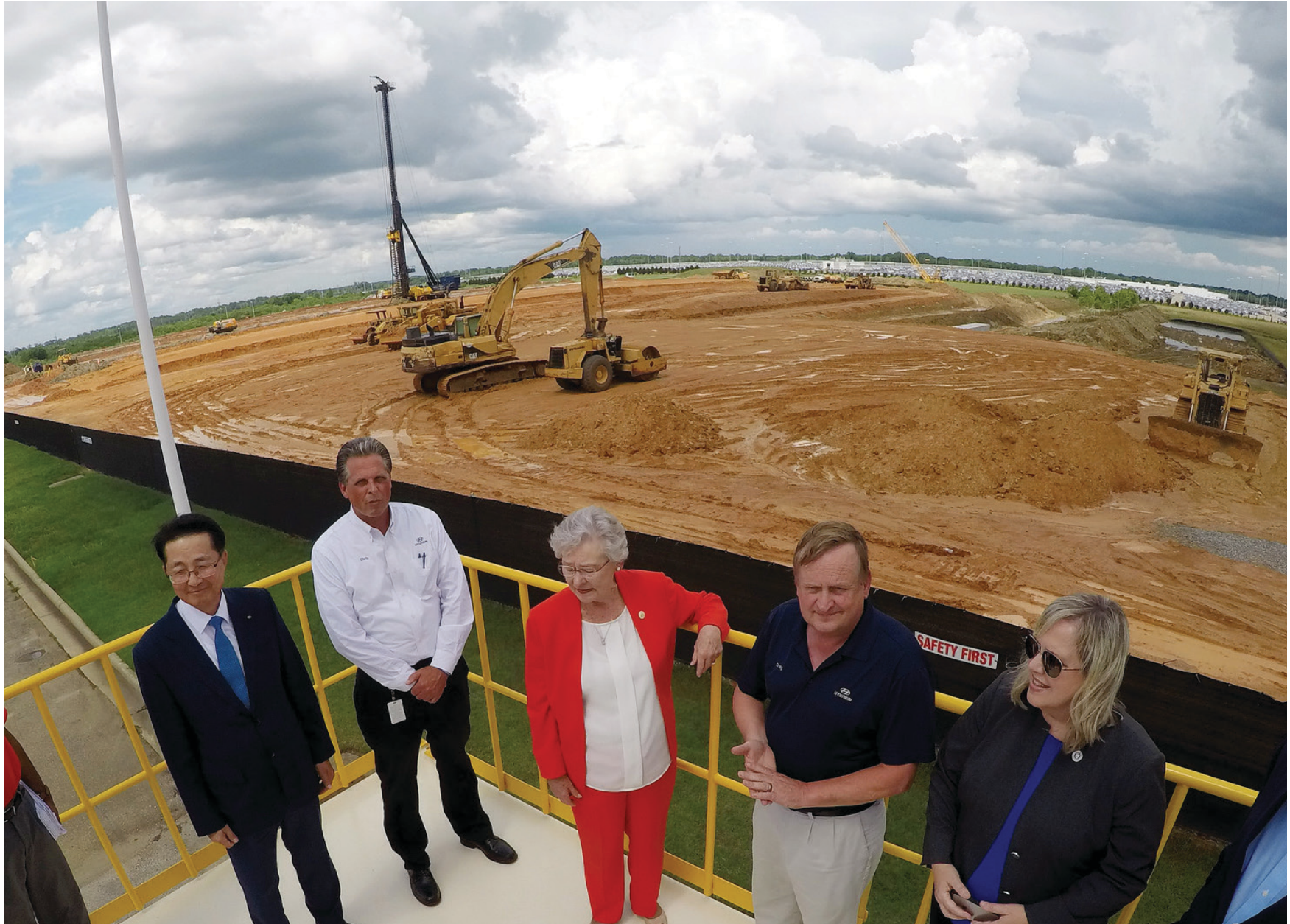
Gov. Kay Ivey joins Hyundai officials at a groundbreaking ceremony marking the official launch of a $388 million project to add a facility to produce engine components at the automaker's Montgomery manufacturing center.