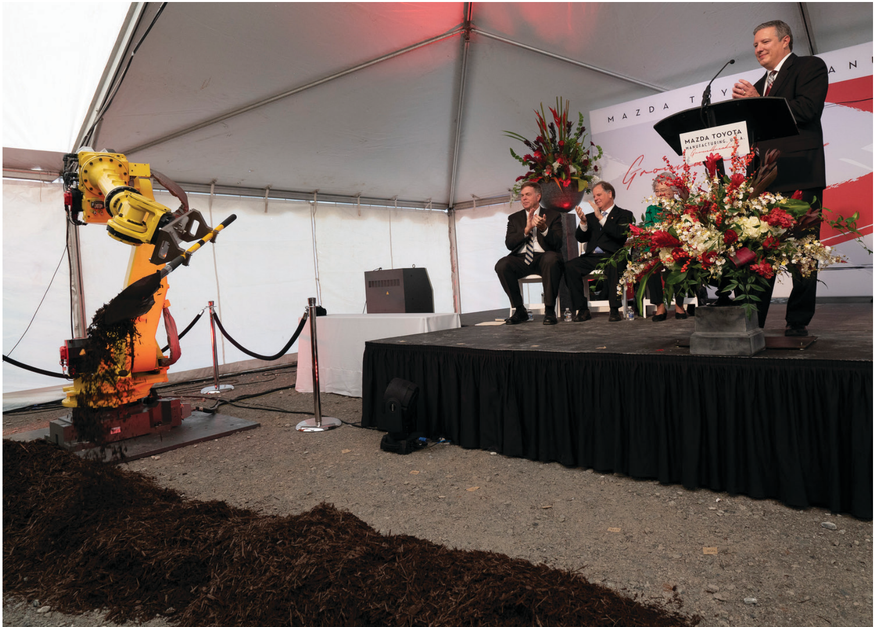
A robot swings into action at a groundbreaking ceremony for Mazda Toyota Manufacturing USA's $1.6 billion, 4,000-worker auto assembly plant being built in Limestone County.