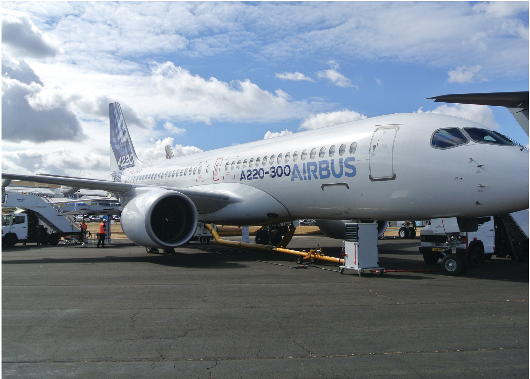
Airbus is building an assembly line at its Mobile manufacturing facility for A220 aircraft, pictured here on a runway at the 2018 Farnborough International Air Show. The $264 million project will create more than 430 jobs.