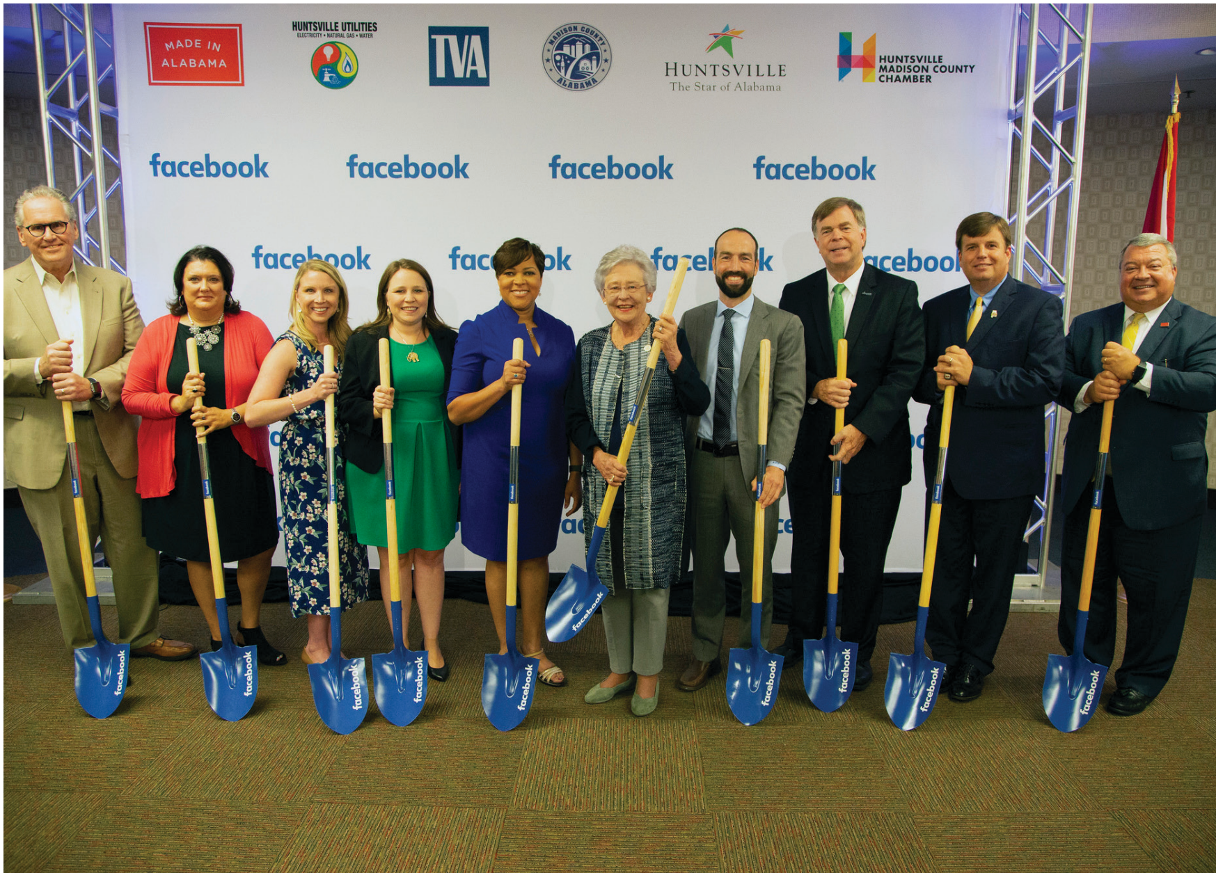
At a groundbreaking ceremony, social media giant Facebook announces plans for a $750 million data center that will create 100 high-paying jobs in Huntsville.